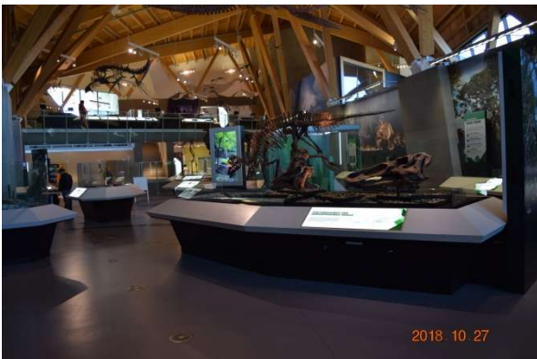
Tour the Philip J. Currie Dinosaur Museum.