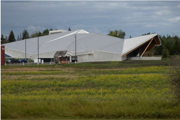
Visit the Philip J. Currie Dinosaur Museum