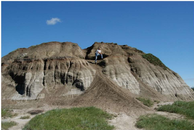
Explore the Kleskun Hill Natural Area.

Proceeds from this tour support the DRI's important work.