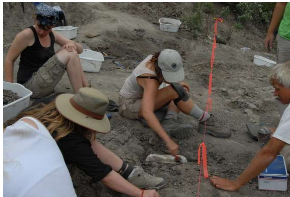
Dig in the Pipestone Creek Bone Bed.